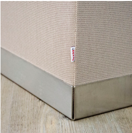
Brushed stainless steel base