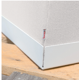
White powder-coated steel base